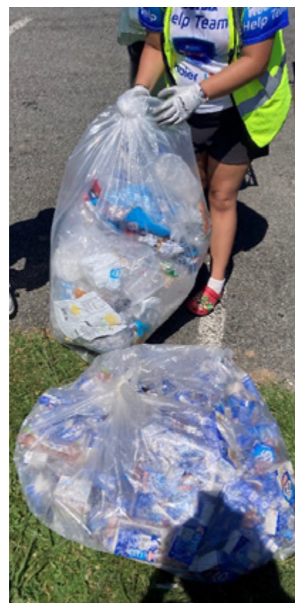
Soft plastic recycling at The Weet-Bix TRYathlon in Hastings with the support of a grant from The Packaging Forum