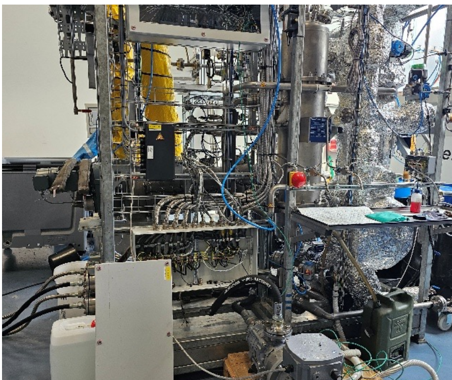
Plastoil Enespa, Hamburg