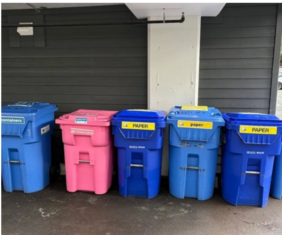
Multi family collection bins in British Columbia - pink for soft plastic