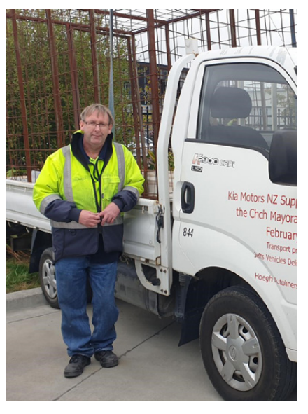
Collecting from The Warehouse