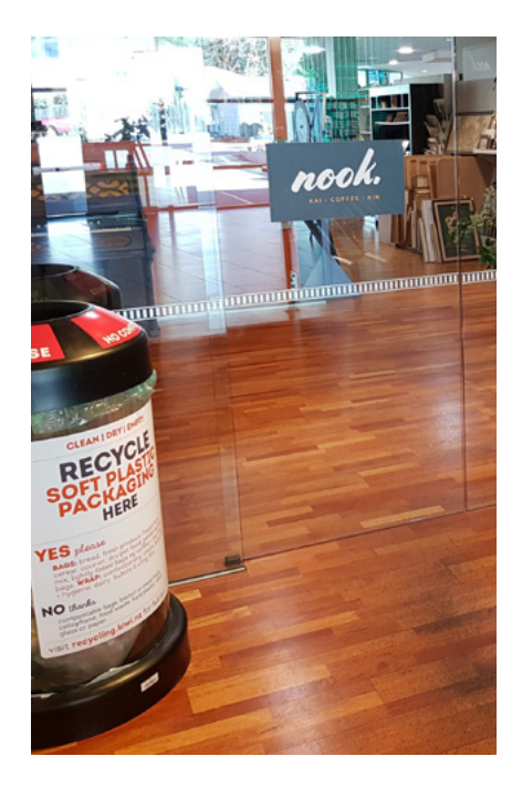
THERE'S A NEW DROP OFF POINT AT THE HABITAT HUB IN NELSON