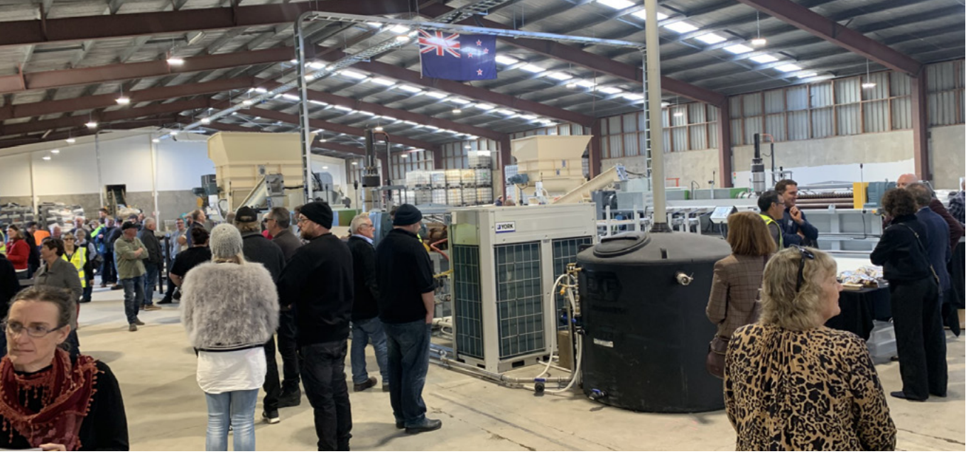
Opening of Future Post's new Blenheim plant